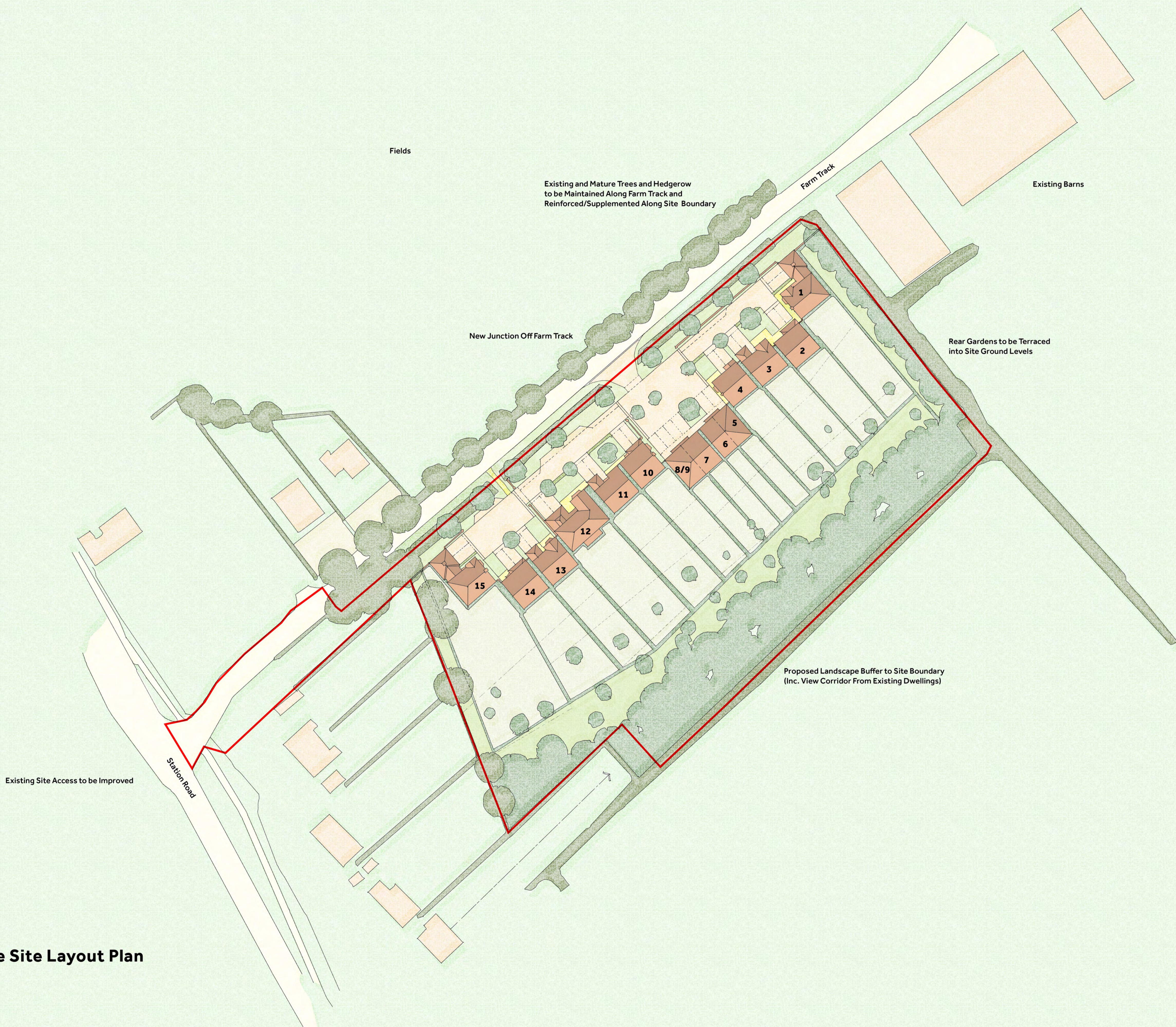
Illustrative Site Layout Plan 1:500 at A1