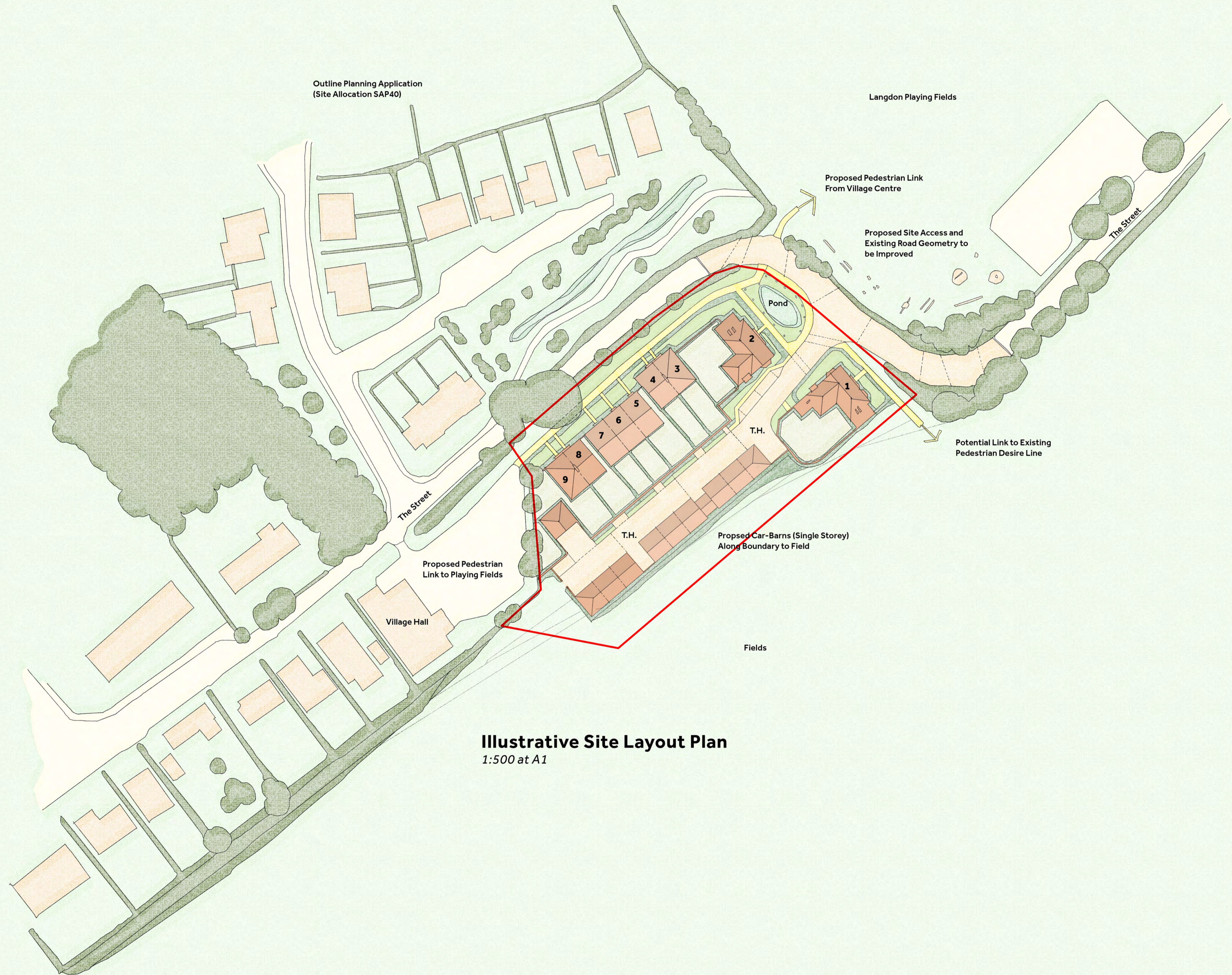
Illustrative Site Layout Plan 1:500 at A1