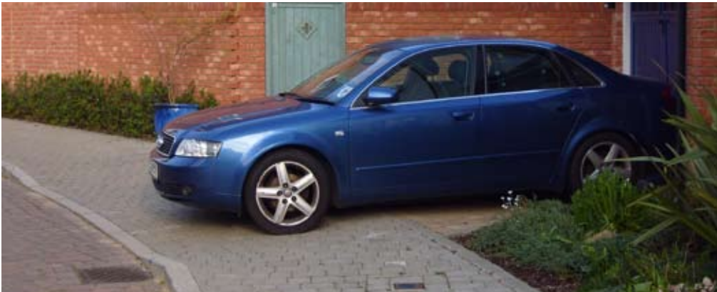
MILTON LANE, LACUNA, KINGS HILL Inconsiderate parking obstructs pedestrians and engenders safety concerns.

Planning Engineers have been making value judgements on attractiveness, functionality and safety for years. Increasingly, their role will be one of 'placemakers', hence they will become adept at interpreting Road Safety Audits and understanding the risks to which the findings direct the Project Team's attention. They will also develop the skills necessary to contribute positively and creatively to the placemaking agenda, not restricting themselves to the application of standards.