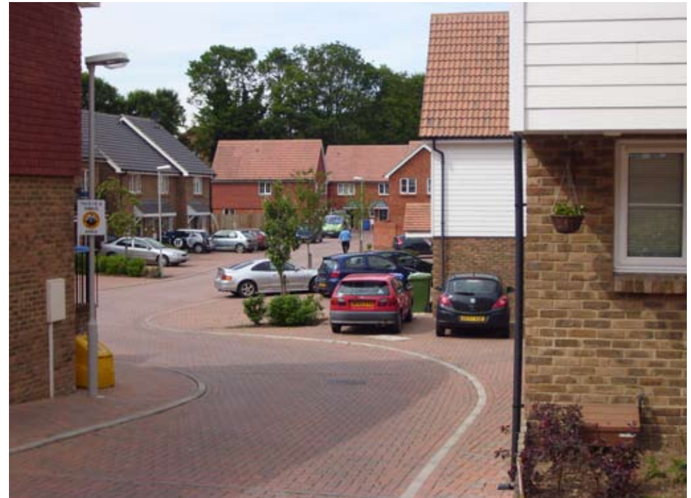
FINCH CLOSE, FAVERSHAM All residents who responded to a satisfaction survey feel that there are parking problems in the street.

This Guidance Note relates primarily to development proposals involving new streets and places. The Guidance Table can be applied to minor (often infill) developments, but regard needs to be had for the severity of concerns about safety and/or amenity before recommendations of refusal are made in respect of numerically “inadequate” parking. Unless demonstrable harm is likely to be caused, it may be inappropriate to make such recommendations. Streets with existing parking problems (usually in the evenings and at weekends) may be identified for inclusion in Development Control and/or Local Development Framework policies.