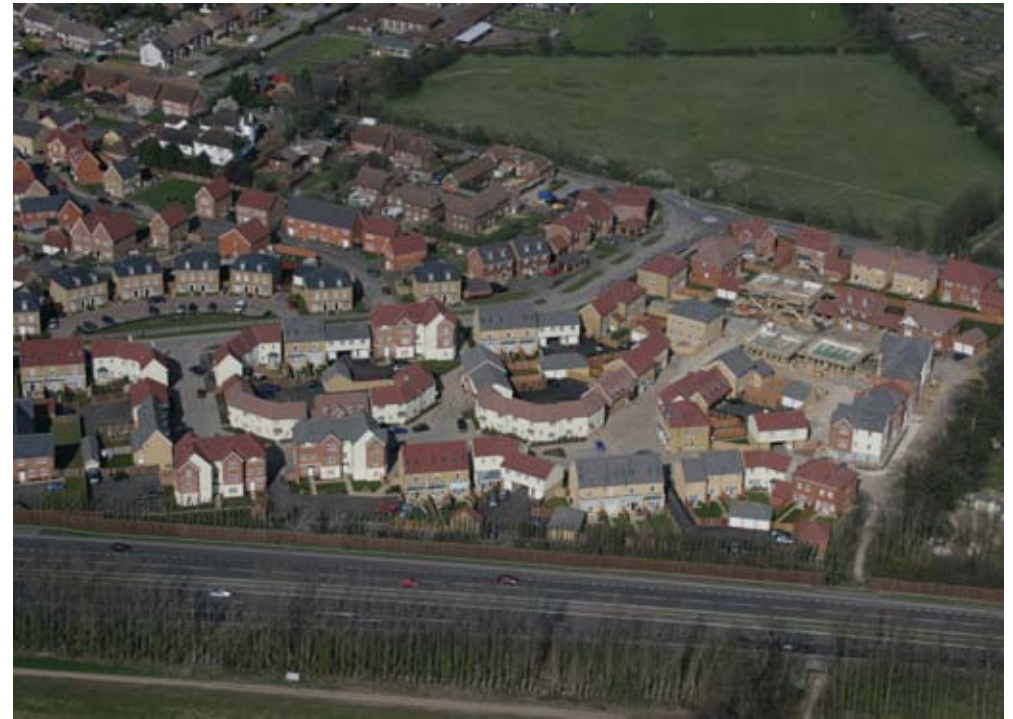
SCOTT AVENUE, CANTERBURY

A design-led approach to parking, achieved through close co-operation, has resulted in good streets and few problems