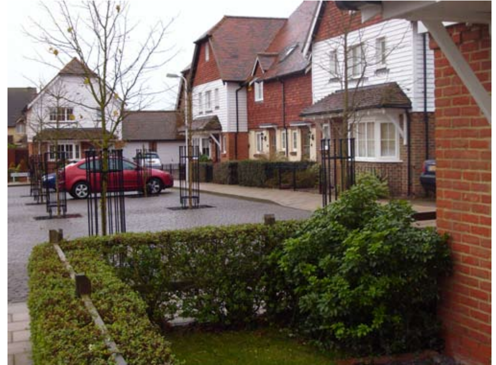
TERLINGHAM VILLAGE PHASE 1, HAWKINGE Street trees provide visual interest in public realm that readily absorbs necessary on-street parking.

NOTE: Retirement and other residential developments with particular occupancy controls are not covered by this Note. While some of the principles are applicable, specialist providers have tended to develop their own evidence base for such accommodation.