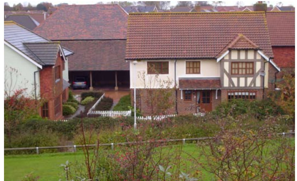
TERLINGHAM VILLAGE PHASE 1, HAWKINGE Car barns figure in residents' appreciation of the parking provision and represent a positive aspect of the built form.

Tenure is also relevant, albeit only where retention in perpetuity of tenancy controls is anticipated should the effect be considered. Census data indicates that privately owned dwellings have higher overall ownership levels than the social sector, albeit longer term high occupancy levels may undermine this in some cases. Similarly, houses have higher vehicle ownership levels than flats .