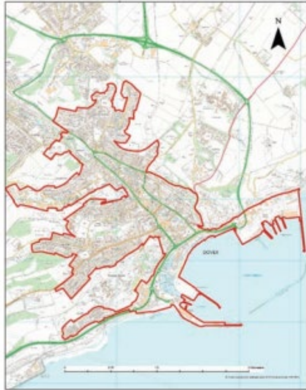
Figure 3 - Dover Urban Area (As set out in Local Plan Regulation 18)

3.7 The NIL requirement in Dover remains applicable as the latest viability position. The Dover area is defined on the map below: