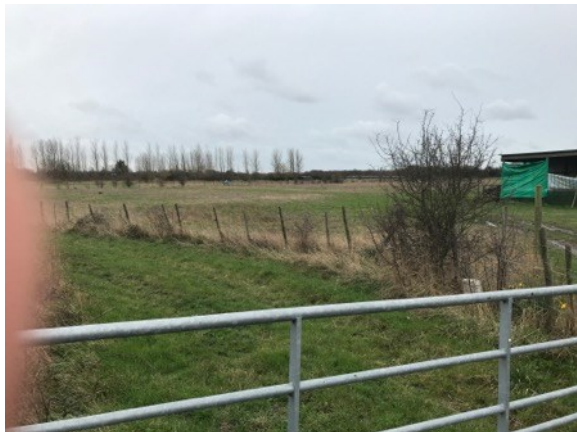
entrance to the site looking northwards