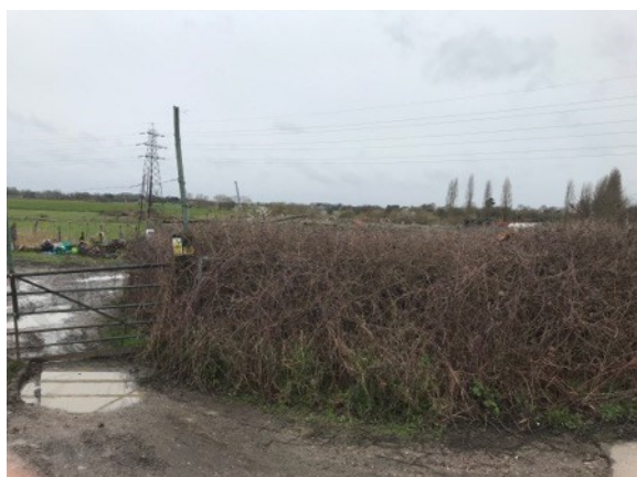
access from Ash Road