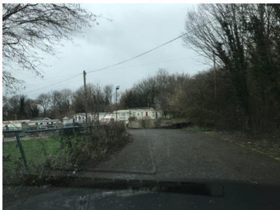
entrance to the existing caravan site