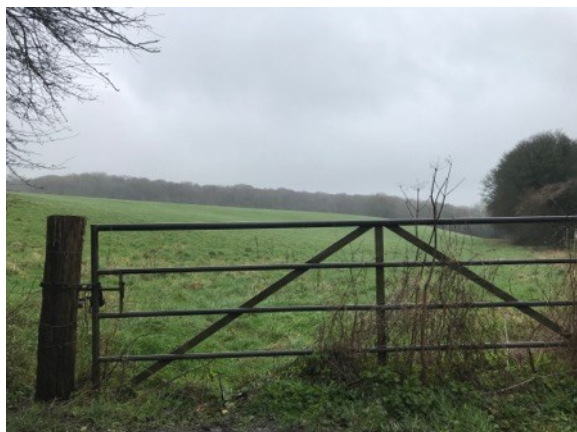
view of the access to the site off Belsey Lane