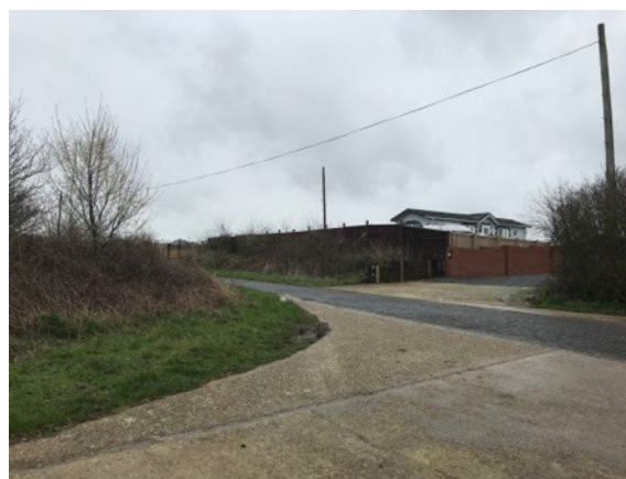
entrance to plot 1