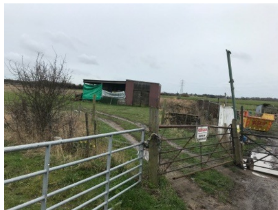
site access shared with adjoining landowner