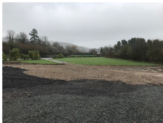
south-east towards Alkham village