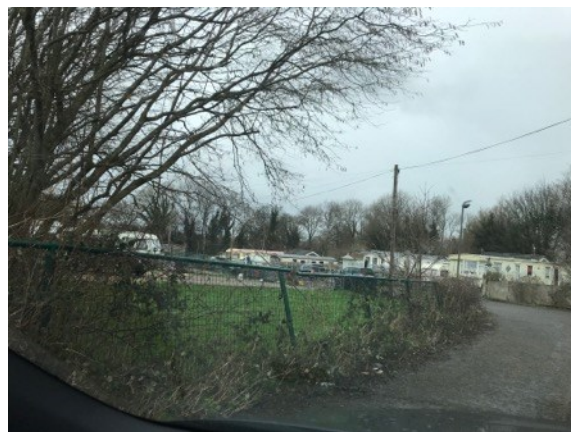
view west to east of the existing site