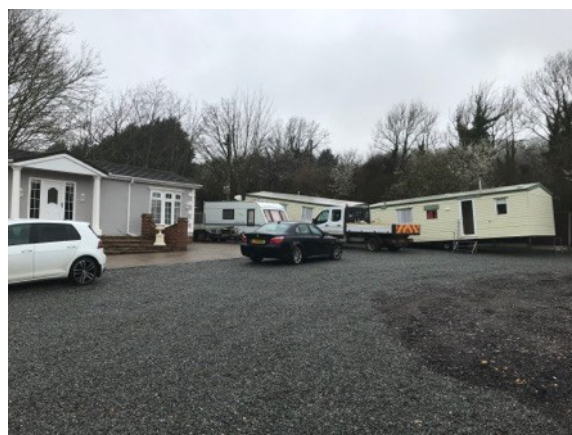
north east view of existing static homes