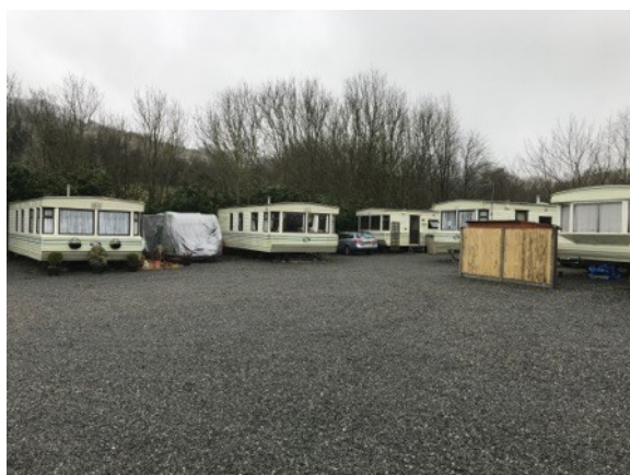
north-west view of static homes