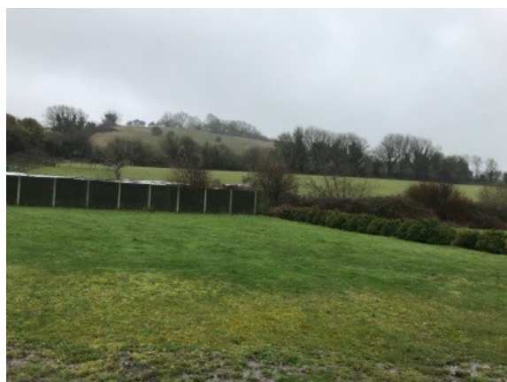
south-east view of the amenity provision