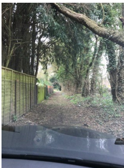
west to east view of the path of the southern boundary with the caravan site