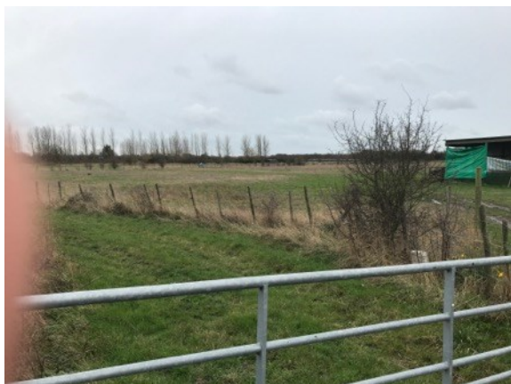
entrance to the site looking northwards