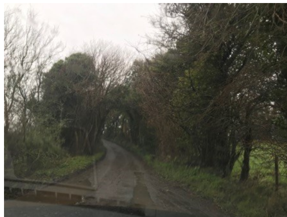
Site to the east off Belsey lane