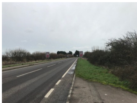
looking south on Ash Road from site access