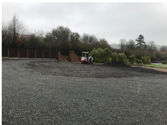
south-east towards site entrance