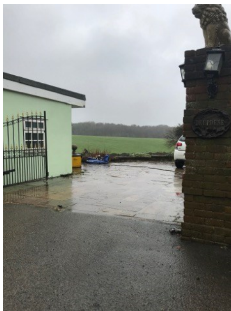
existing entrance to Romany Caravan